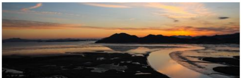
Photo: Boseong Green Tea Plantation Yeosu Cable Car Jeonju Hanok Village Suncheonman Bay